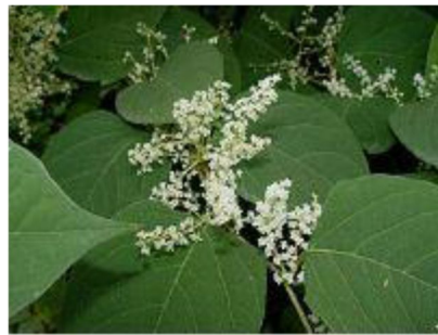
Knotweed leaves and flowers de renouée